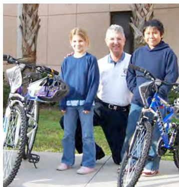
Bikes for Ballard